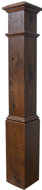
4092-CW0-DIS1 Character White Oak Distressed #1 Stained