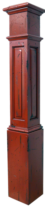
4092-RP-CA-DIS2 Character Alder Distressed #2 Antique Red/Black Glazed