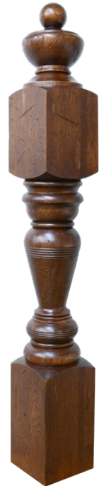
ESN90-725-CW0-DIS2 Character White Oak Distressed #2 Stained