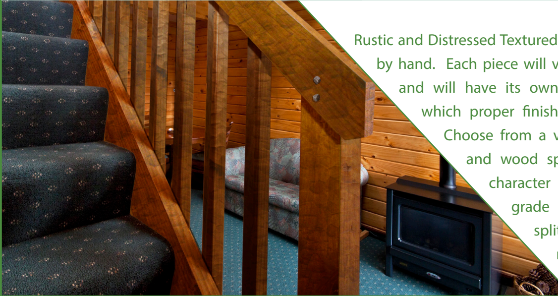
Hand Hewn 31 Texture: 4000 newel, 4255 balusters, custom handrail

Rustic and Distressed Textured Options are done by hand. Each piece will vary from the next and will have its own unique qualities which proper finishing will enhance. Choose from a variety of textures and wood species in clear or character grade. Character grade will have knots, splits, holes etc., but no representation on how many or their size.