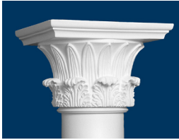
Temple of the Winds

*Decorative Capitals are not recommended for Non-Tapered Columns.