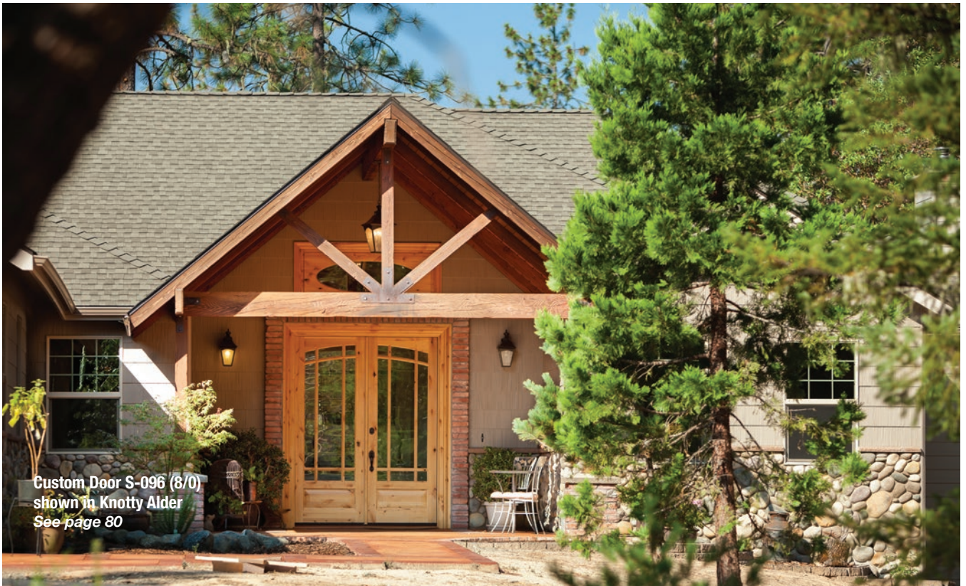
Custom Door S-096 (8/0) shown in Knotty Alder See page 80

Adequate overhang is very critical to the life and performance of a wood stile and rail door. A proper overhang will help protect your door from the elements and extend the life of the door. In most climate conditions the following formula can be used to determine the appropriate amount of overhang: X=1/2Y (where X is the length of the overhang required and Y is the distance from the bottom of the door to the base of the overhang.) For example, if the measurement from the bottom of the door to the base of the overhang is 8 feet, the required overhang is 4 feet. For more severe climates, very wet or dry areas, the following formula should be used: Y=X .