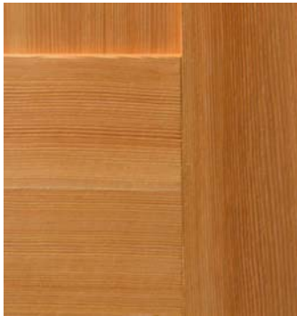
Course Grain Fir Doors

At Rogue Valley Door we slice our own veneers and then meticulously grade them to ensure only the highest quality fiber is used in our wood doors. In the past, only a small percentage of this wood could make the grade and pass our quality inspection. With a fresh approach we knew we could positively impact the environment, save a precious dwindling resource and make use of the stock that had small