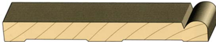
BB747: NEW - Stocked in 5-1/4" in Poplar