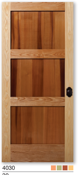
30 Ash and Cedar shown with Square Sticking