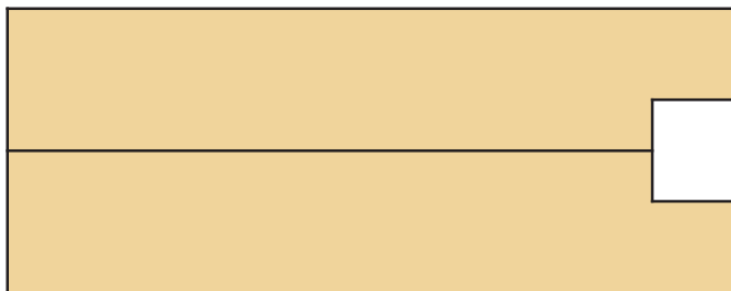
Rogue Premium Plus Solid Wood

With our Rogue Premium Plus option you will receive a solid door made from two pieces of laminated lumber. This sturdier option provides superior resistance to inevitable wear and tear. If a compression or a scratch occurs in the door, our solid wood option allows for a much easier repair. Rogue Premium Plus durable construction, there are no overhang requirements.