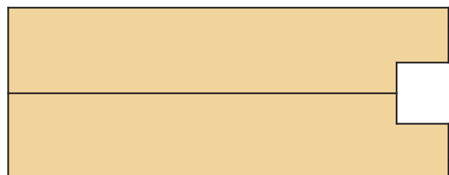
Rogue Premium Solid Wood