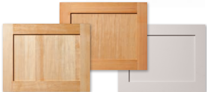
Available in Pine, Fir and Primed

Our high performance doors are available in Pine, Fir, or Primed to complement your home design. And because of Rogue Premium Plus durable construction, there are no overhang requirements. Upgrade to a Rogue Premium Plus Door, and you can feel confident your door will look great and hold up under the toughest conditions.